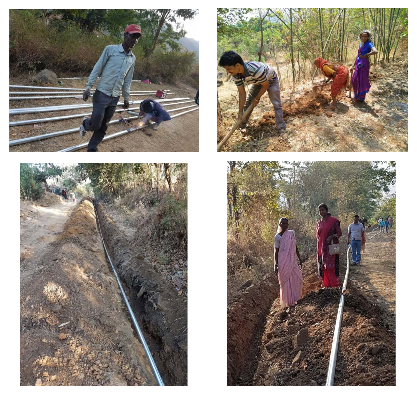
Rotarian Swati and the village chief, who is a lady, are visiting the work in progress.

Phase 2 . To lay the pipeline from the well to the new reservoir at the mountain top. This work needed more hands, more sweats and extreme determination. Villagers, men, women and young girls volunteered as the benefits from the project they could not have imagined just a few months early.